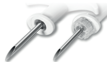
T-IP needle 2.6 mm vs Slim needle 2.0 mm