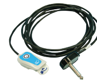
Bovie EZ Link Remote Activation Switch (SERS2)