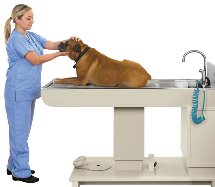
Table lower – 36" People who aren't as tall (4'11") and are treating larger animals can adjust the height of the Hi-Lo Wet Table for the best patient access and a comfortable posture. More efficient, faster treatment.

Table higher – 42" A tall (6'1") person can raise the Hi-Lo Table to prevent back strain. No more extreme bending over to treat the patient. Reduces fatigue and provides better visualization of the treatment site.