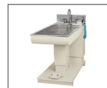
Free standing when floor drain available