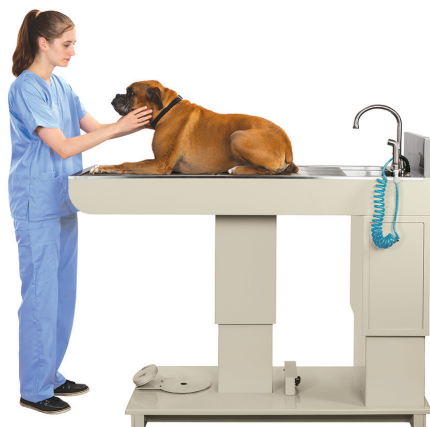
Table higher – 42" A tall (6'1") person can raise the Hi-Lo Table to prevent back strain. No more extreme bending over to treat the patient. Reduces fatigue and provides better visualization of the treatment site.