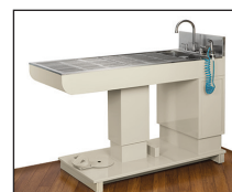
Perpendicular to plumbed wall