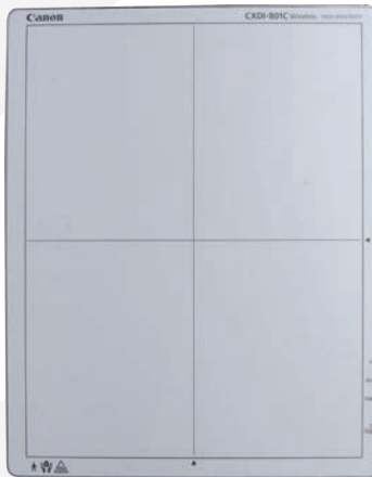
11"x14" Canon CXDI-801C Cesium Wireless Panel