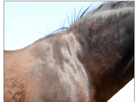
Pictures of typical EMS horses with fat accumulation in the neck, often referred to as a "cresty" neck.