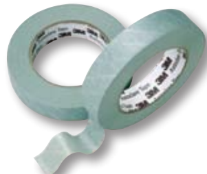
3M™ Comply™ 1222 (tan) and 1255 (blue) Indicator Tapes for Steam