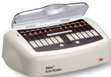
3M™ Attest™ 290 Auto-reader – 12-well capacity

Attest Auto-readers incubate at 60^{\circ}\text{C} \pm 2^{\circ}\text{C} ( 140^{\circ}\text{F} \pm 3^{\circ}\text{F} ) and automatically read the fluorescence produced by the 3M Attest 1292-S Rapid Readout biological indicators. The Attest Auto-reader will hold the result until recorded and may help streamline your processes. The Auto-reader is also designed to allow continued incubation to verify the test organism's outgrowth.