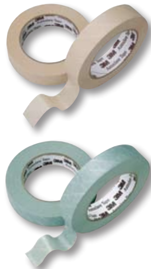
3M™ Comply™ 1222 (tan) and 1255 (blue) Indicator Tapes for Steam

3M™ Comply™ Indicator Tapes for steam sterilization are reliable process indicators. The chemical indicator stripe on 3M™ Comply™ 1255 indicator tape will turn light to dark for easy identification when exposed to a steam sterilization oxide process. These products are simple to apply and the reliable high tack adhesive adheres well to packaging material. 3M™ tape dispensers models C22 and M920 provide convenient dispensing of 3M™ Indicator Tapes.