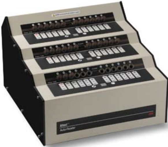
3M™ Attest™ 293 Auto-reader – 36-well capacity

3M Attest 293 and 290 are accurate, reliable Attest 1292-S biological indicator incubators with an automatic readout feature. Model 293 Auto-reader is designed specifically for industrial sterilization processing and was developed with input from leading medical device users. It has a 36-well capacity. The unit provides automatic calibration on every biological indicator. Factory calibration documentation is provided with each unit and annual calibration service is available.