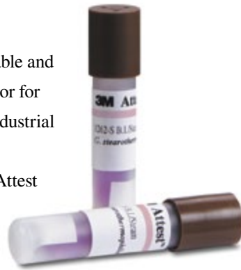
3M Attest 1262-S

The Attest 1262-S is a self-contained biological indicator. This design reduces testing time and eliminates the potential for cross-contamination associated with the culturing of conventional spore strips. The Attest 1262-S design is comprised of a paper carrier inoculated with a standardized population of Geobacillus stearothermophilus ATCC® 7953 spores, a glass ampoule containing recovery medium which includes a pH indicator dye, a plastic cap with filter,