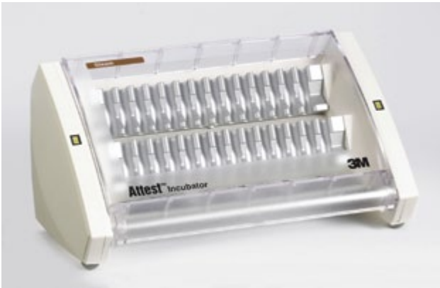
3M Model 126 Incubator

The Attest 1262-S has not been tested or validated for monitoring sterilization processes other than steam, such as ethylene oxide, dry heat, radiation, hydrogen peroxide, or other chemical or low temperature processes.