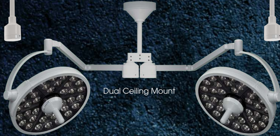
Dual Ceiling Mount