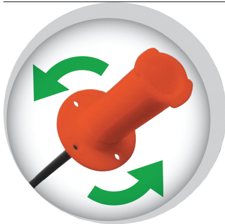
Rotating Suture Collar